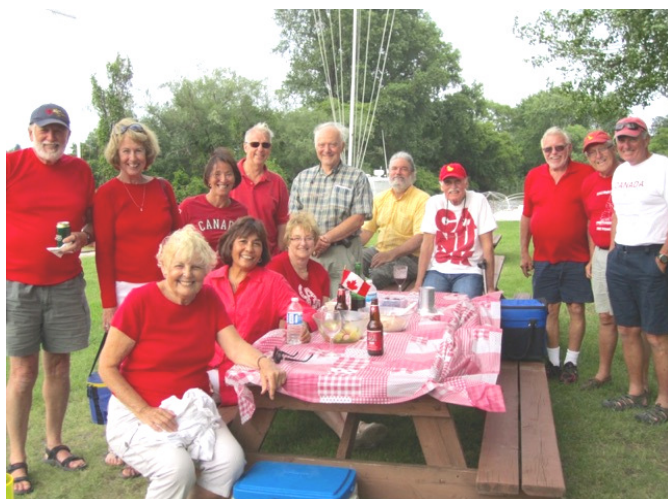
15 members celebrated Canada Day at the club with a sail & BBQ. Absent from the photo are Sue Balfe and Lee Ann Halpin (the photographer)