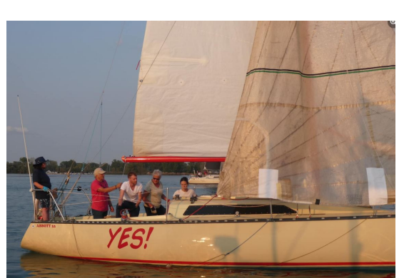
Best corrected YES LMYC