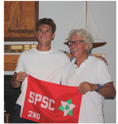
2nd PHRF B Jin Frati Blue Moon